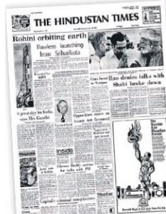
HT put the news of Rohini's launch on the front page of its July 19, 1980 edition.

Thereafter every 12 hours two more such orbits will be seen in regular periodicity.